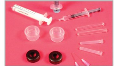
8. Medical and Pharma