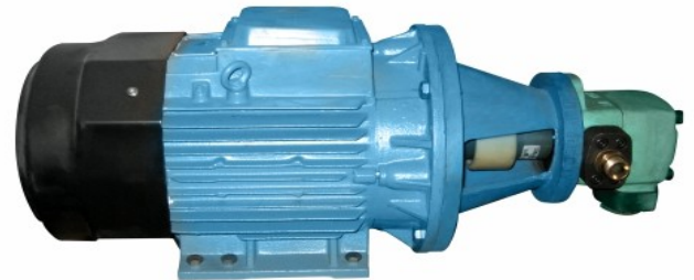
Fixed displacement Pump