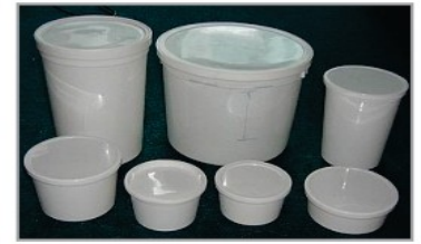
4. Food and packaging