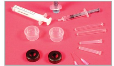
8. Medical and Pharma